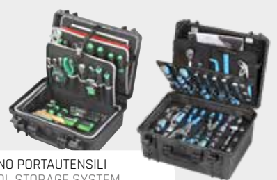
VANO PORTAUTENSILI TOOL STORAGE SYSTEM