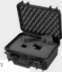
SPUGNE CUBETTATE CUBED FOAMS