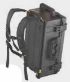
MAXPACK Zaino / Backpack