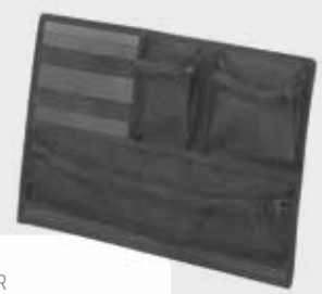
TASCHE LID ORGANIZER