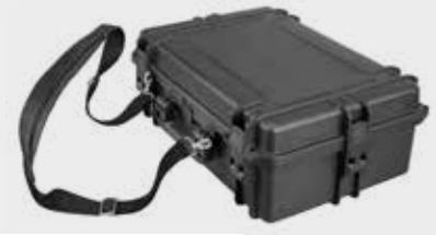
TRAMAX Tracolla imbottita / Padded shoulder strap