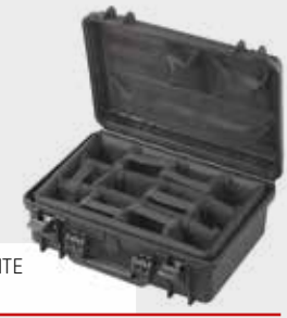
DIVISORIE IMBOTTITE PADDED DIVIDERS